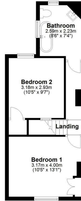
First Floor Approx. 35.1 sq. metres (377.8 sq. feet)