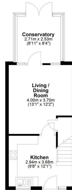
Ground Floor Approx. 33.1 sq. metres (355.8 sq. feet)