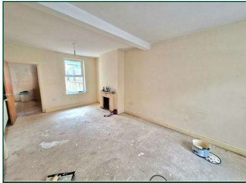
GROUND FLOOR 452 sq. ft. (42.0 sq.m.) approx.