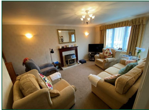
GROUND FLOOR 474 sq.ft. (44.1 sq.m.) approx.