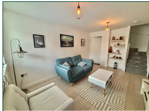
1ST FLOOR 298 sq. ft. (27.6 sq. m.) approx.