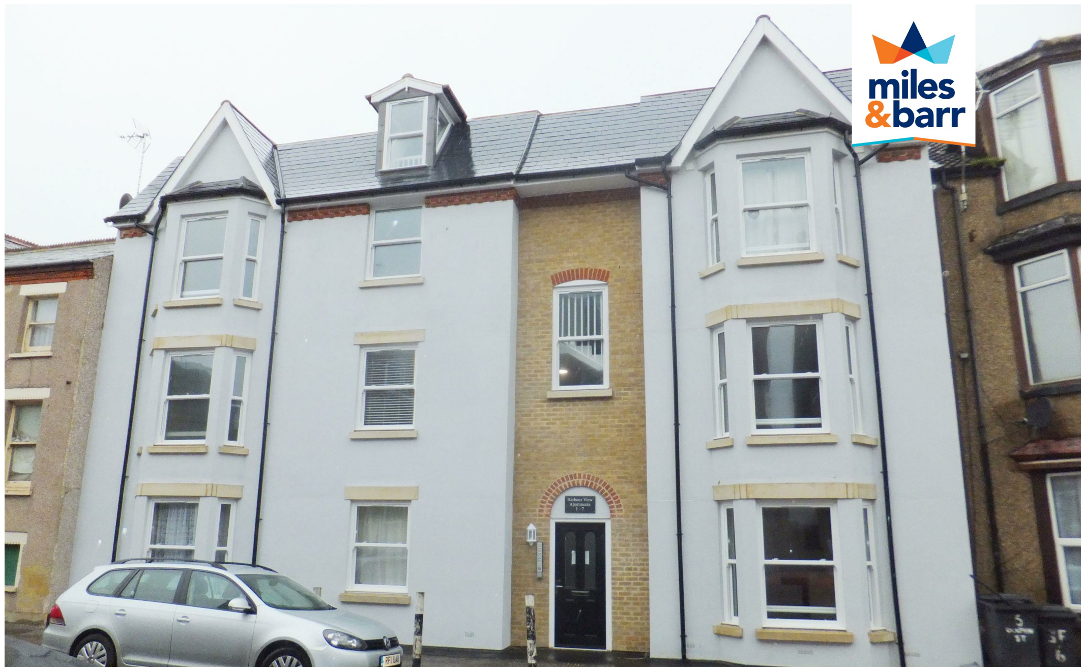
HARBOUR VIEW APARTMENTS 5 DOLPHIN STREET HERNE BAY