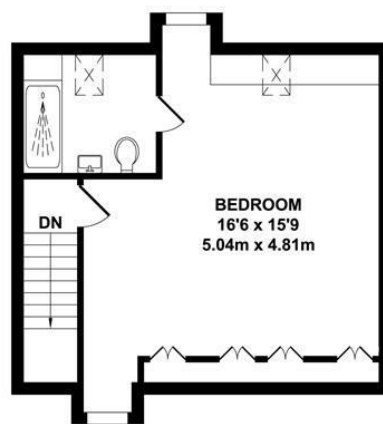
SECOND FLOOR APPROX. FLOOR AREA 359 SQ.FT. (33.36 SQ.M.)