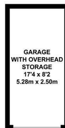
APPROX. FLOOR AREA 142 SQ.FT. (13.20 SQ.M.)

TOTAL APPROX. FLOOR AREA 1173 SQ.FT. (108.98 SQ.M.)