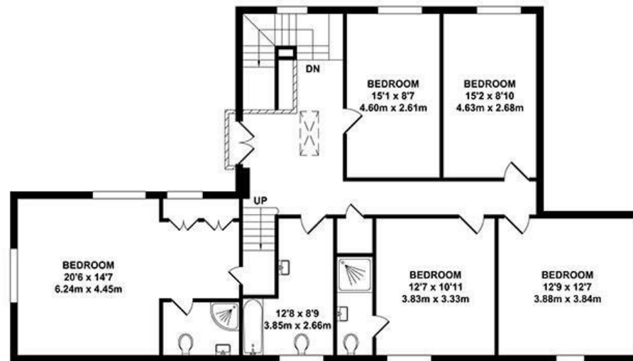
FIRST FLOOR APPROX. FLOOR AREA 1264 SQ.FT. (117.45 SQ.M.)