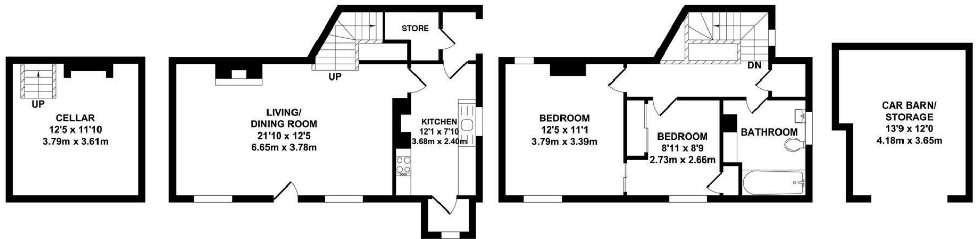
LOWER GROUND FLOOR APPROX. FLOOR AREA 147 SQ.FT. (13.68 SQ.M.)