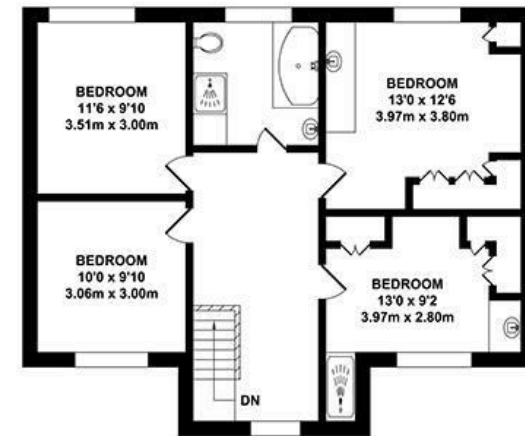
FIRST FLOOR APPROX. FLOOR AREA 760 SQ.FT. (70.65 SQ.M.)

TOTAL APPROX. FLOOR AREA 2271 SQ.FT. (210.9 SQ.M.)