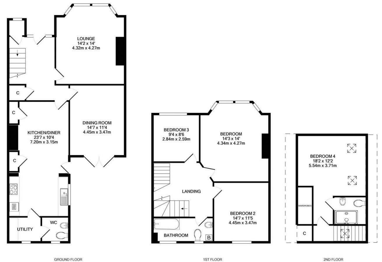
Marlborough Road, Penylan, Cardiff, CF23 5BZ Size 156m 2 / 1678sqft