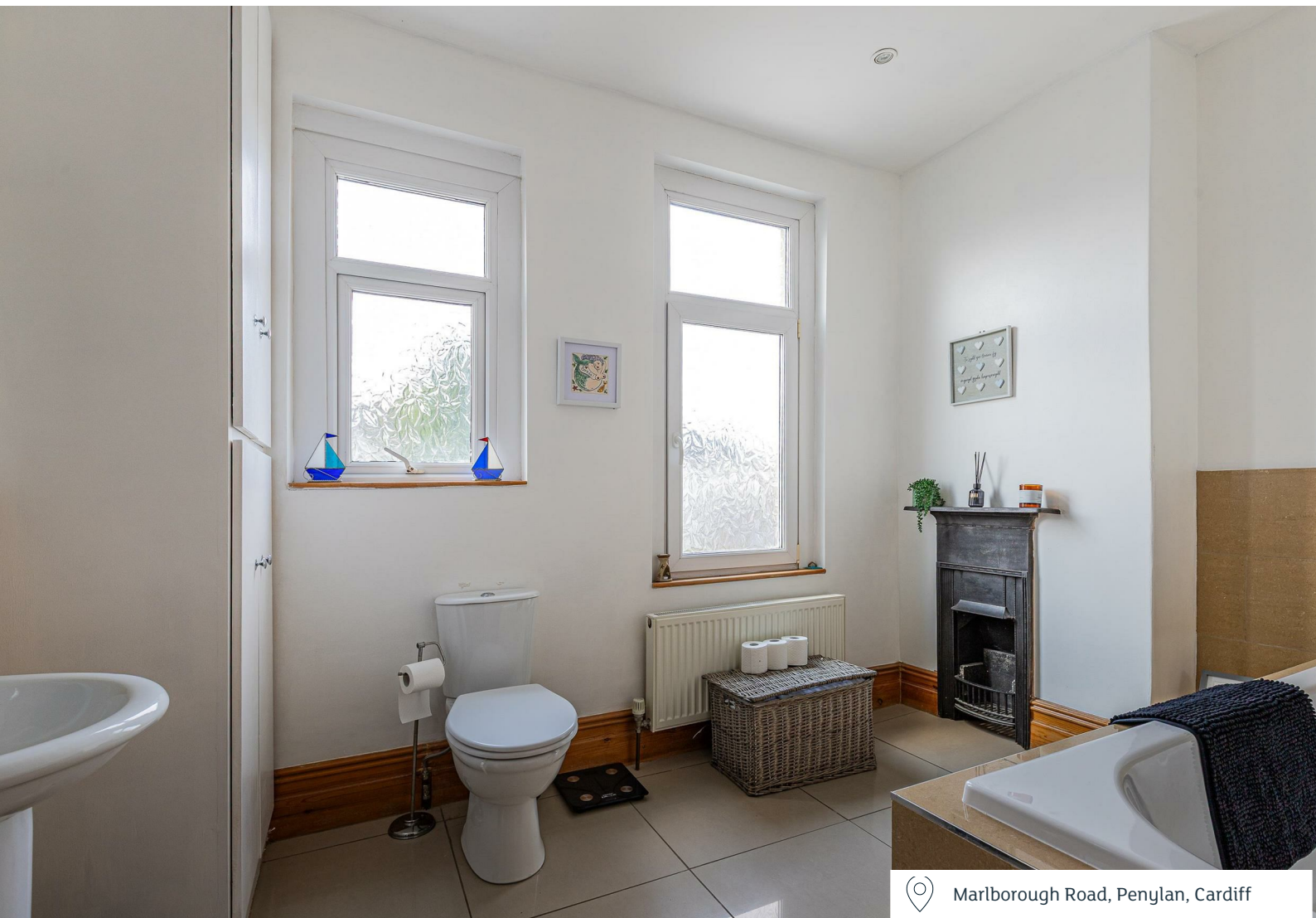
Marlborough Road, Penylan, Cardiff