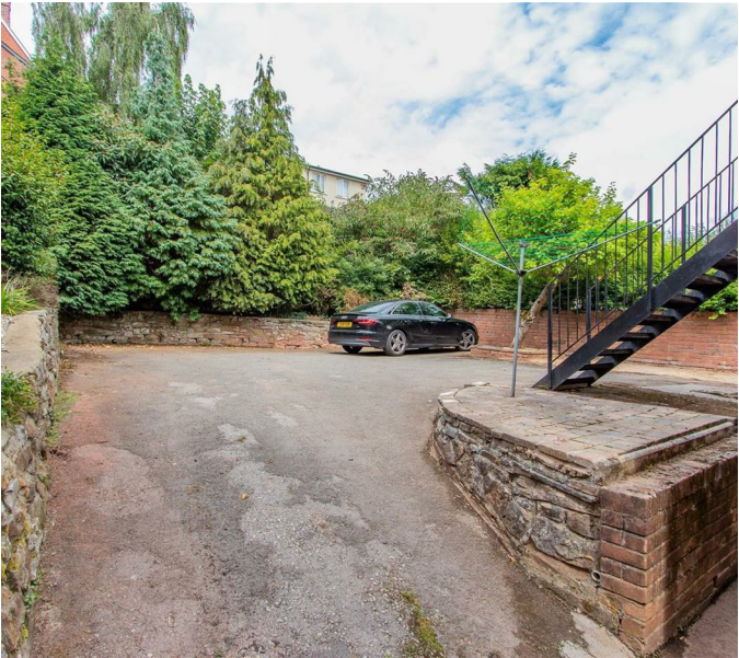
Bryngwyn Road, Newport