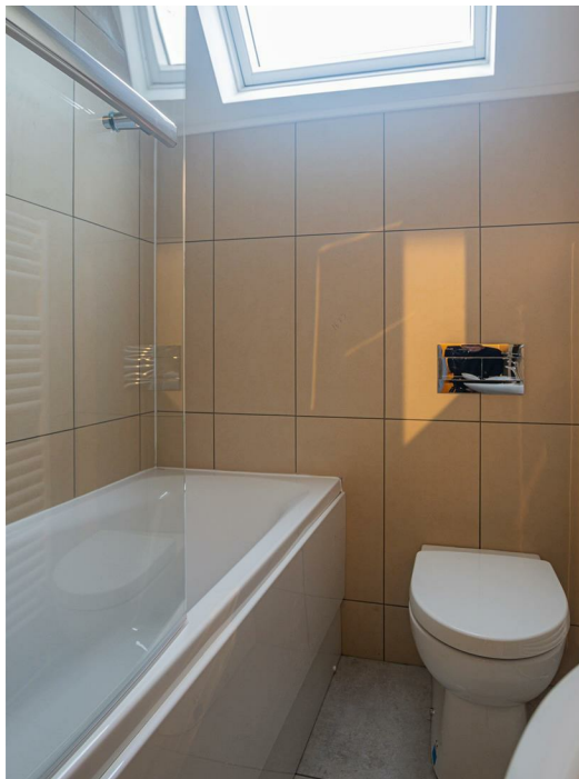
Richmond Road, Roath