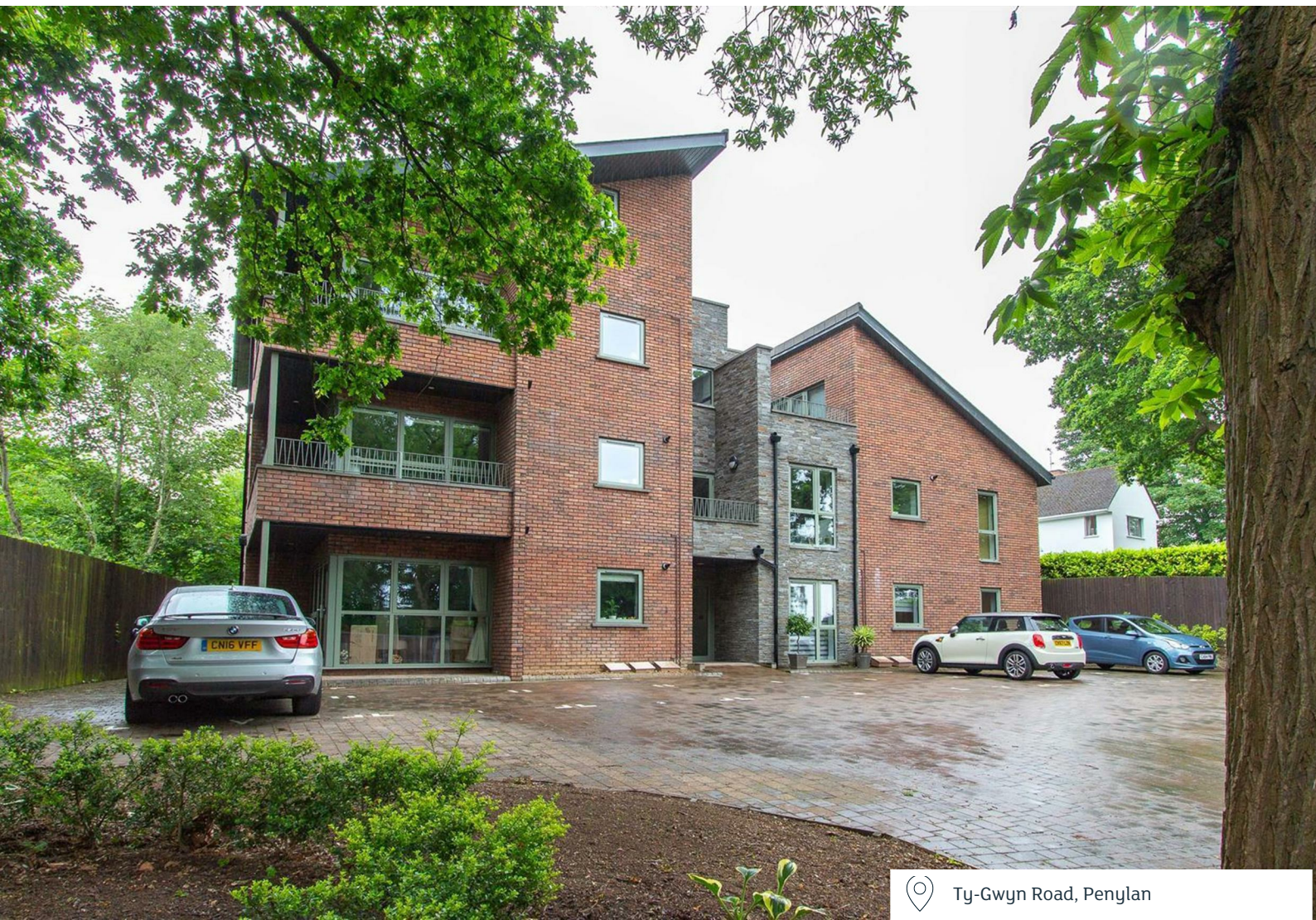
Ty-Gwyn Road, Penylan

All measurements are approximate and for display purposes only