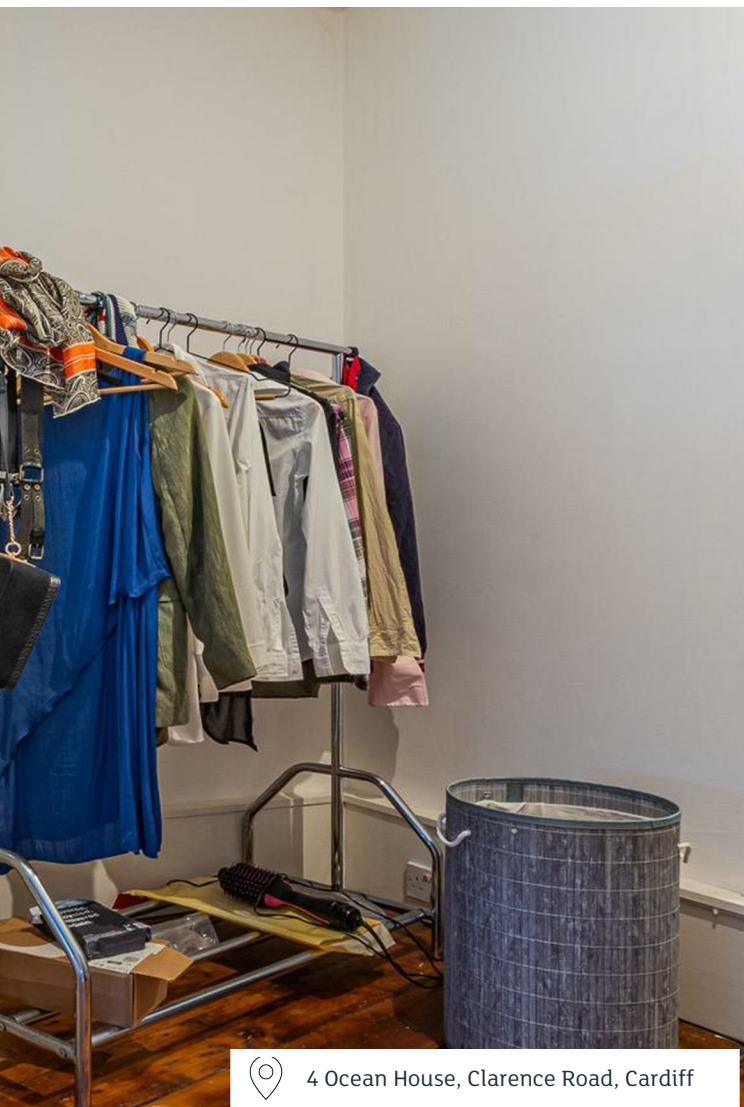
4 Ocean House, Clarence Road, Cardiff