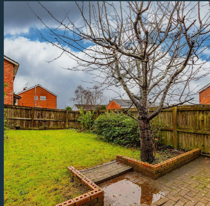
St Nicholas Court