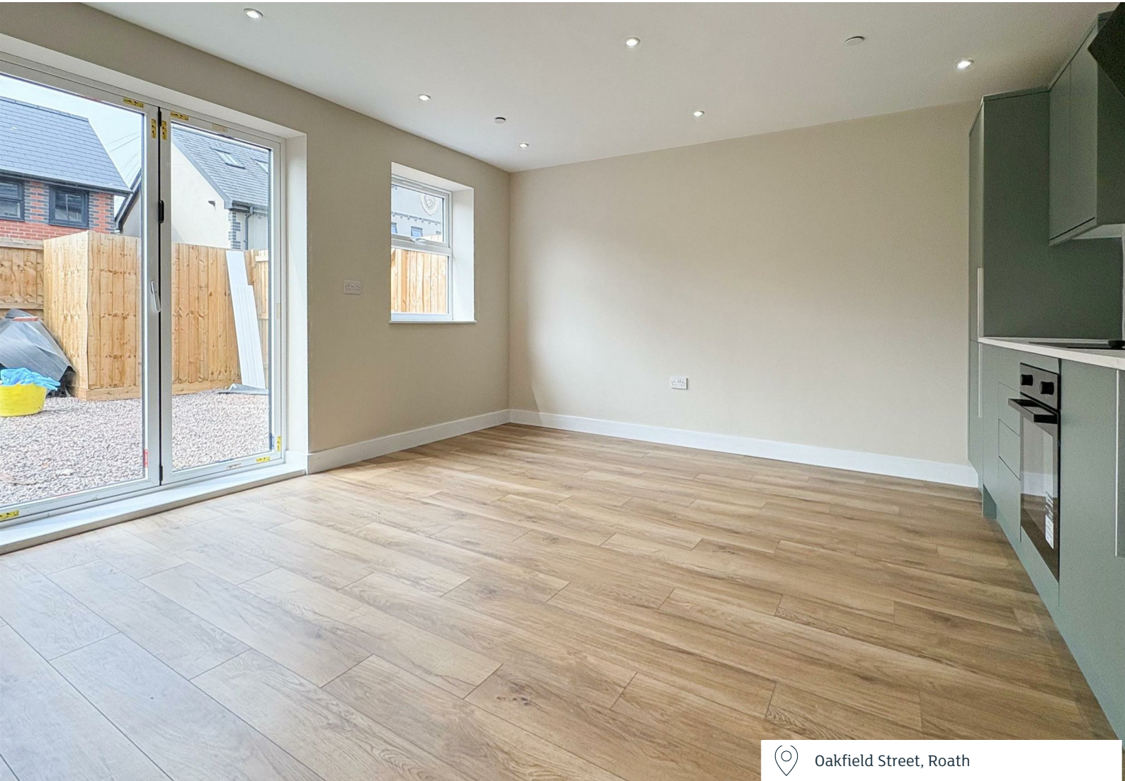
Oakfield Street, Roath