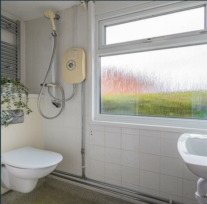
St Nicholas Court