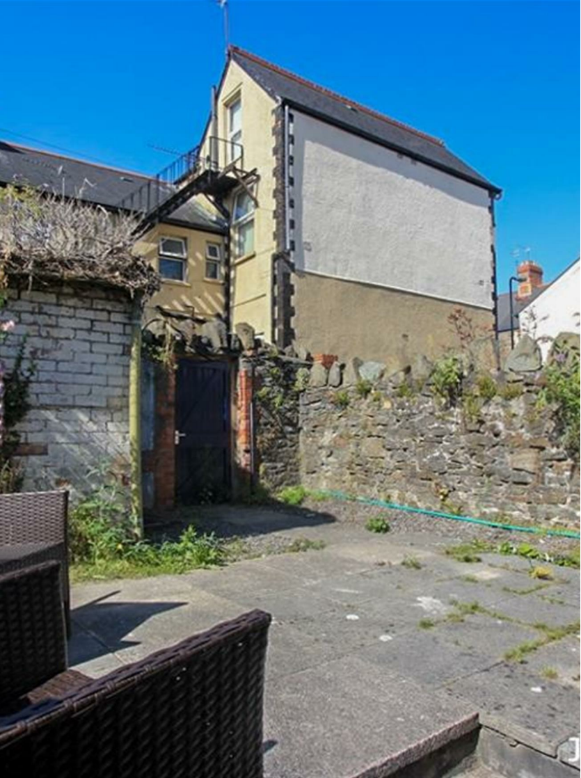
Ninian Road, Roath Park