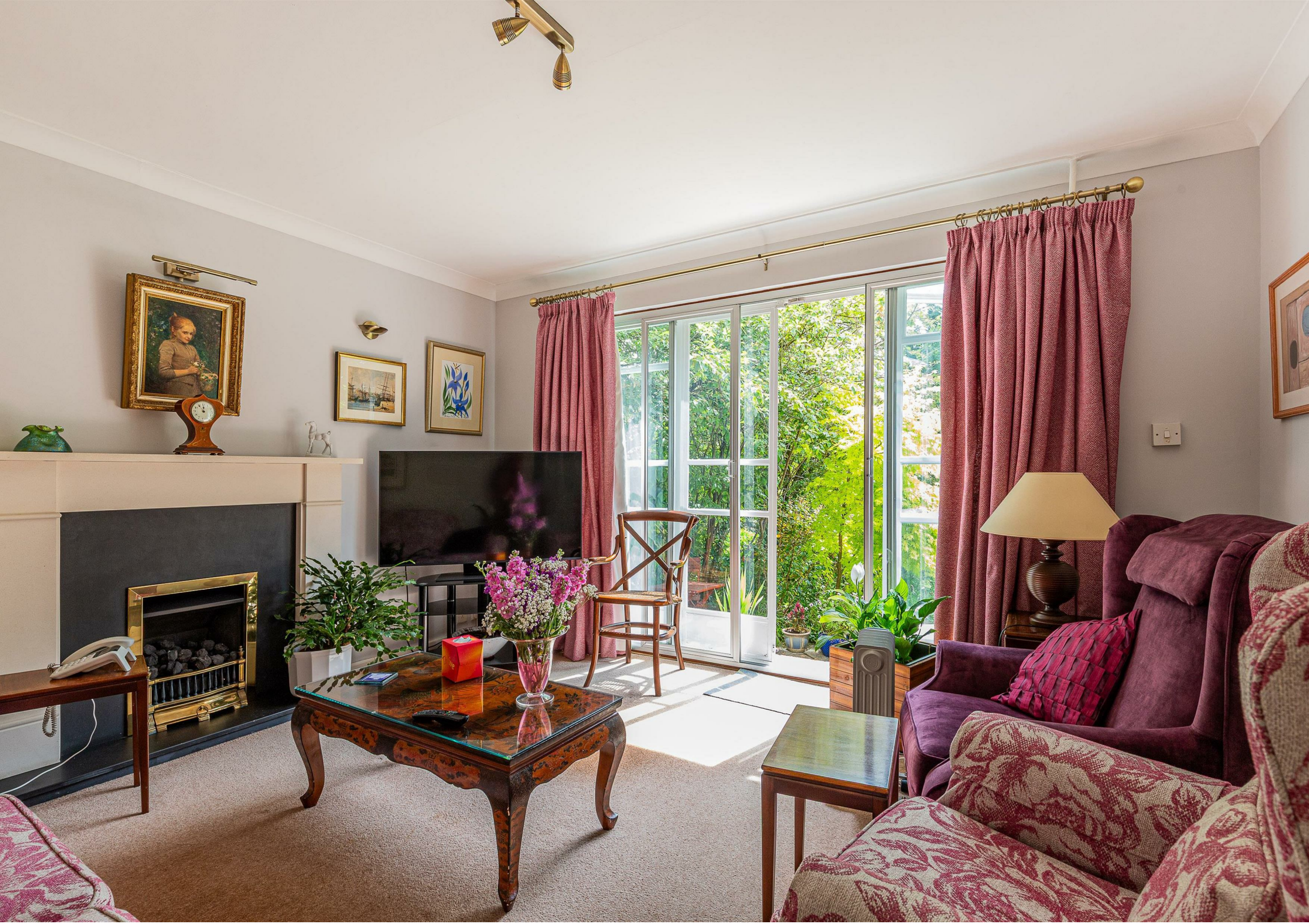
French Consulate Cedar High, Hollybush Road, Cyncoed,