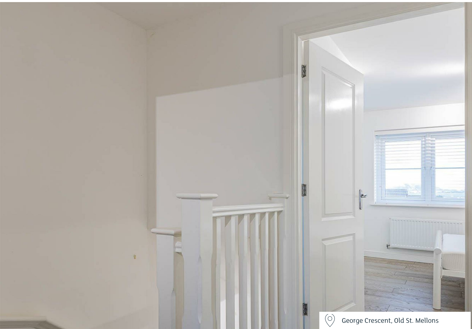
George Crescent, Old St. Mellons