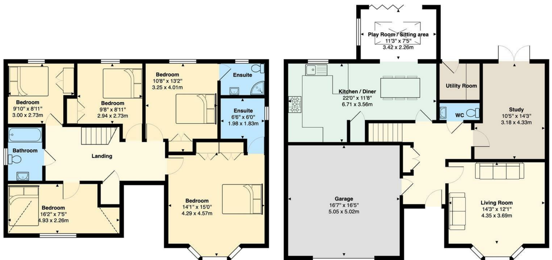
Tyn Y Berllan, Lisvane, CF14 0TS