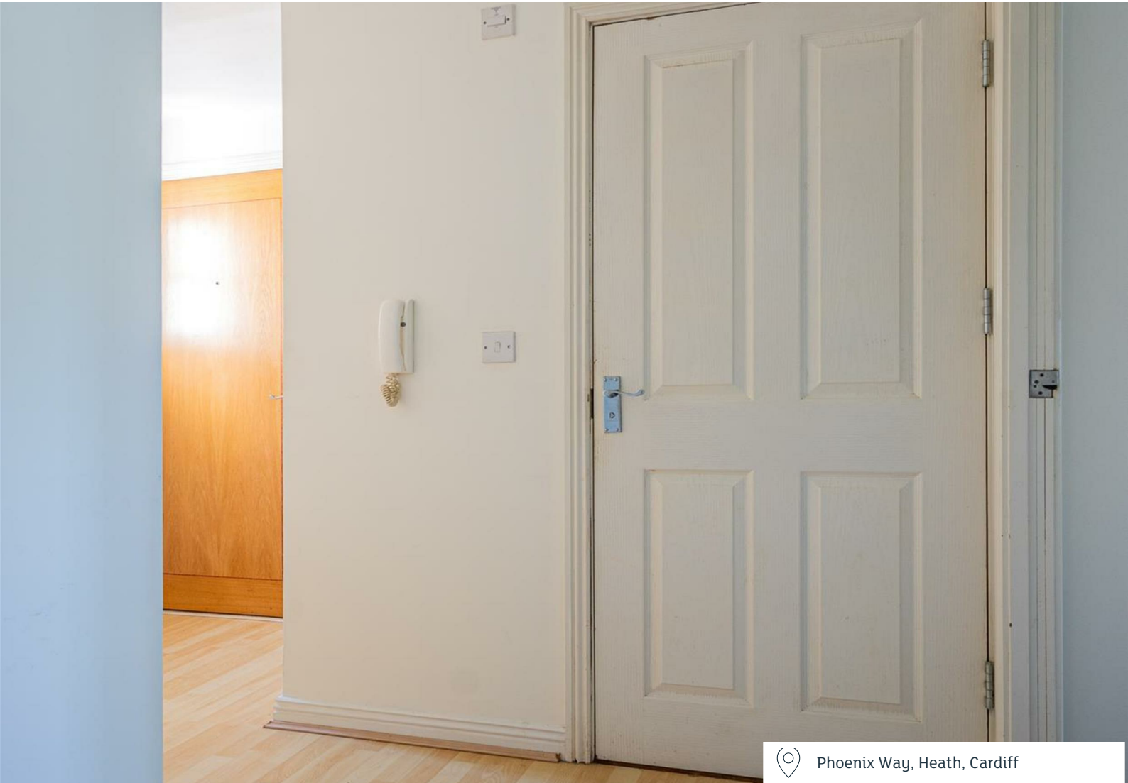
Phoenix Way, Heath, Cardiff

Ground Floor Flat Interior Area 641.68 sq ft