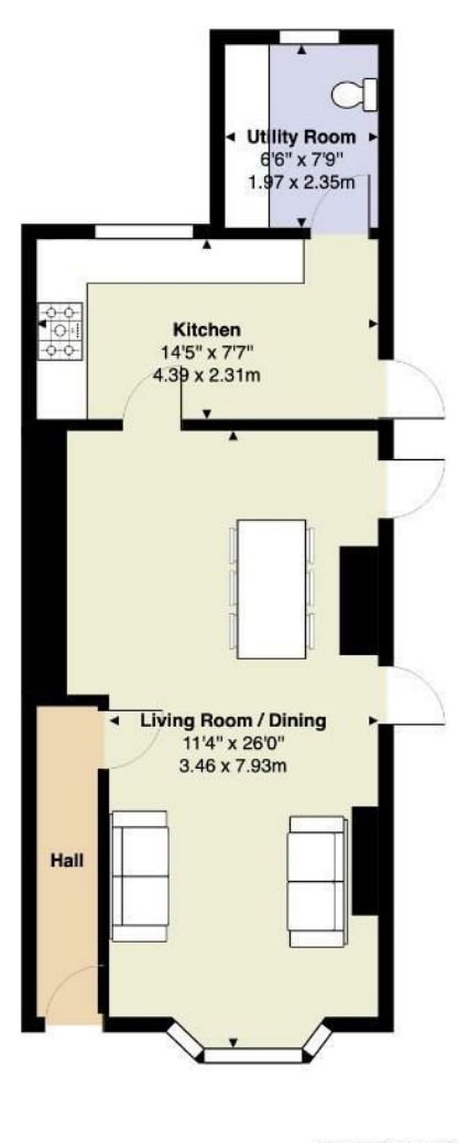
Heol Hir, Llanishen, Cardiff Total Area: 966 ft<sup>2</sup> ... 89.7 m<sup>2</sup> All measurements are approximate and for display purposes only