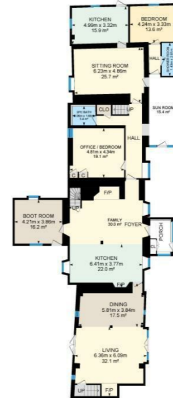
Ground Floor Interior Area 247.57 m 2

Main Building: Total Interior Area Above Grade 424.48 m 2