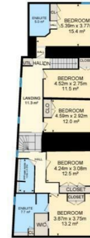
1st Floor Interior Area 135.38 m 2