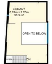
1st Floor Library Interior Area 41.54 m 2