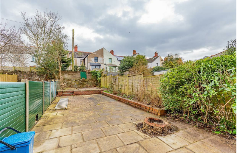
Westbury Terrace, Victoria Park