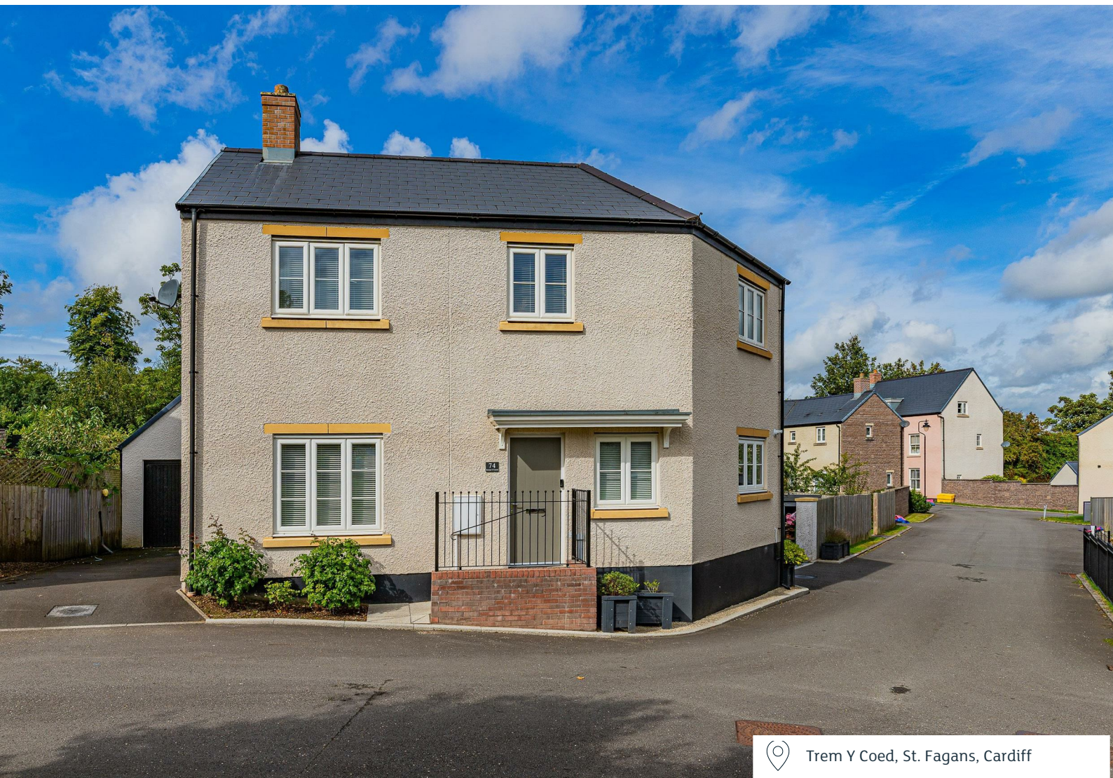
Trem Y Coed, St. Fagans, Cardiff