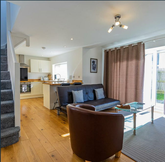
Llantrisant Road, Llandaff