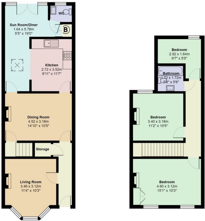
Penhill Road Total Area: 107.7 m² ... 1160 ft² All measurements are approximate and for display purposes only