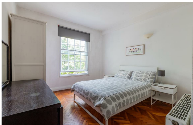
Marlborough House, Westgate Street