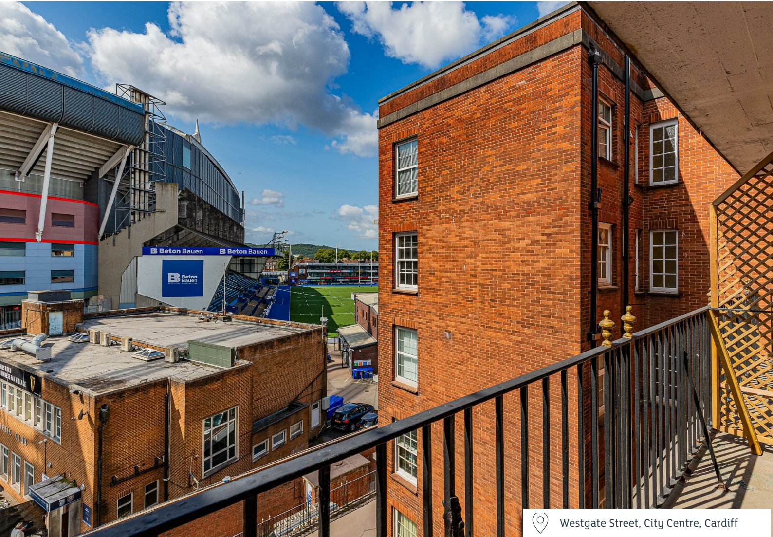
Westgate Street, City Centre, Cardiff

All measurements are approximate and for display purposes only