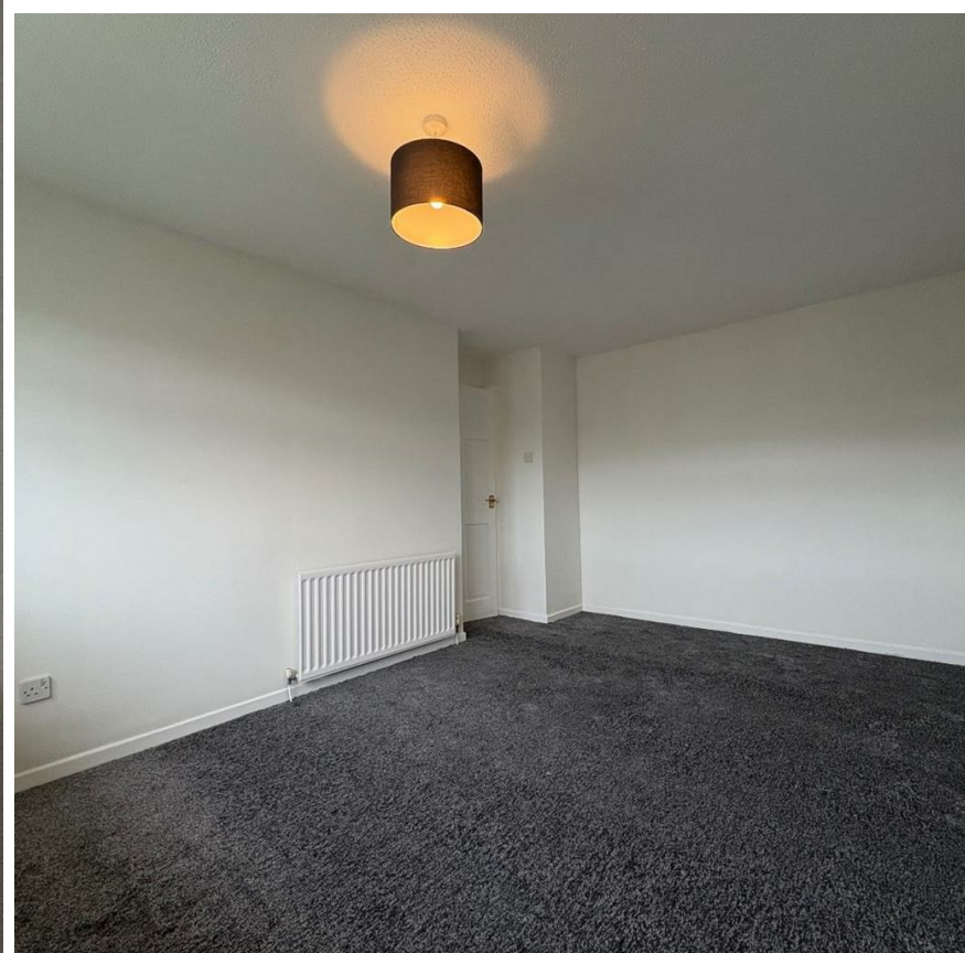
Nicholson Webb Close, Cardiff