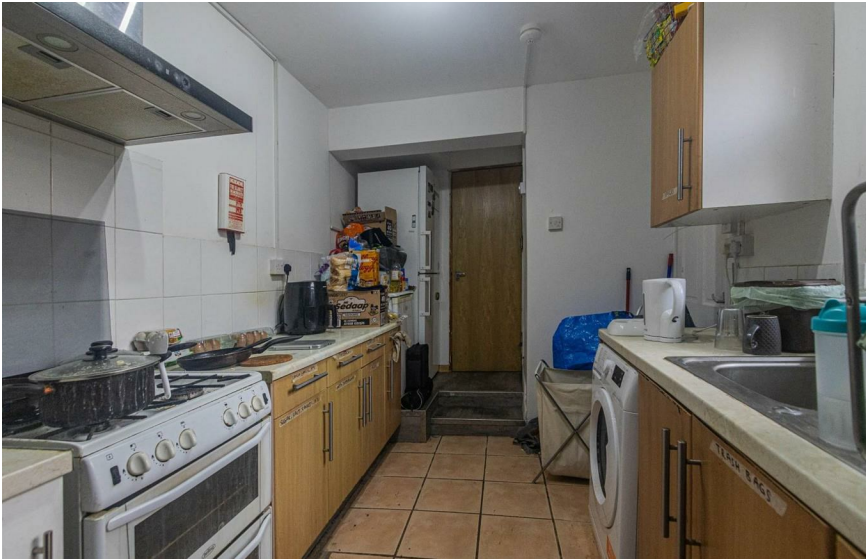
Coburn Street, Cathays