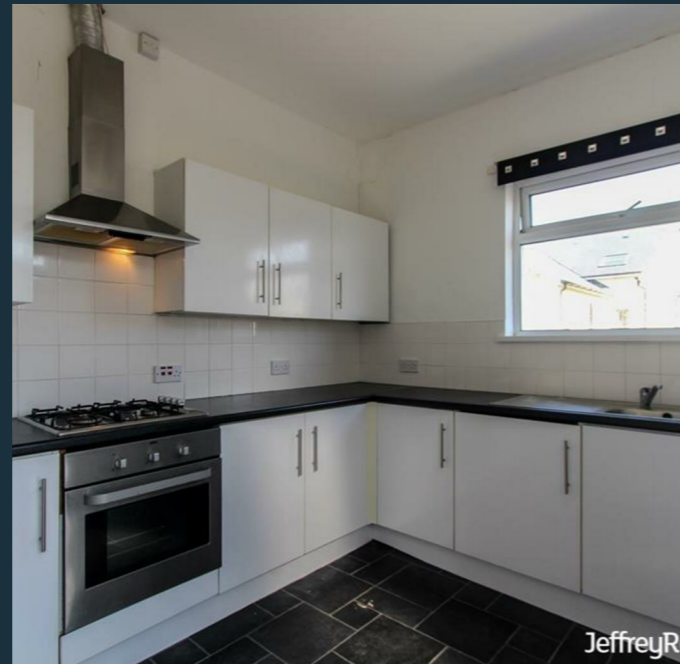
Tewkesbury Street, Cathays