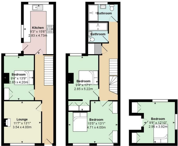
Talworth Street, Roath