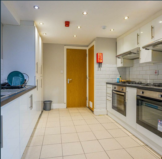
Merthyr Street, Cathays