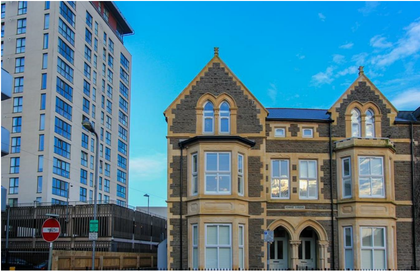
Howard Gardens, Roath.