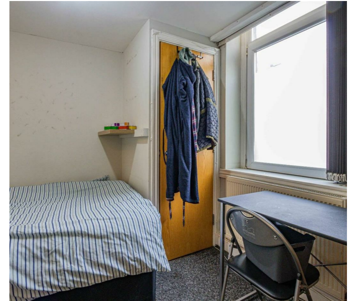
Merthyr Street, Cathays