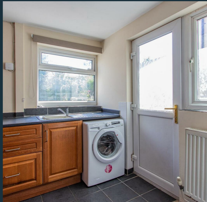
Hirwain Street, Cathays.