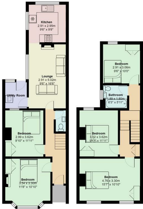
Mackintosh Place, Roath

Total Area: 111.4 m² ... 1199 ft² All measurements are approximate and for display purposes only