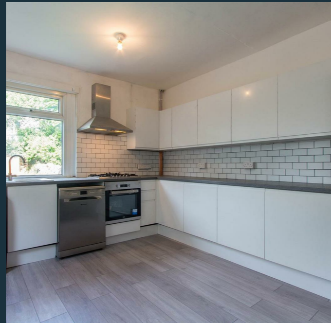
Miskin Street, Cathays