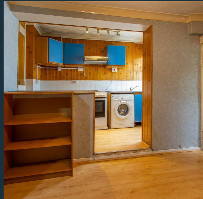
Thesiger Street, Cathays