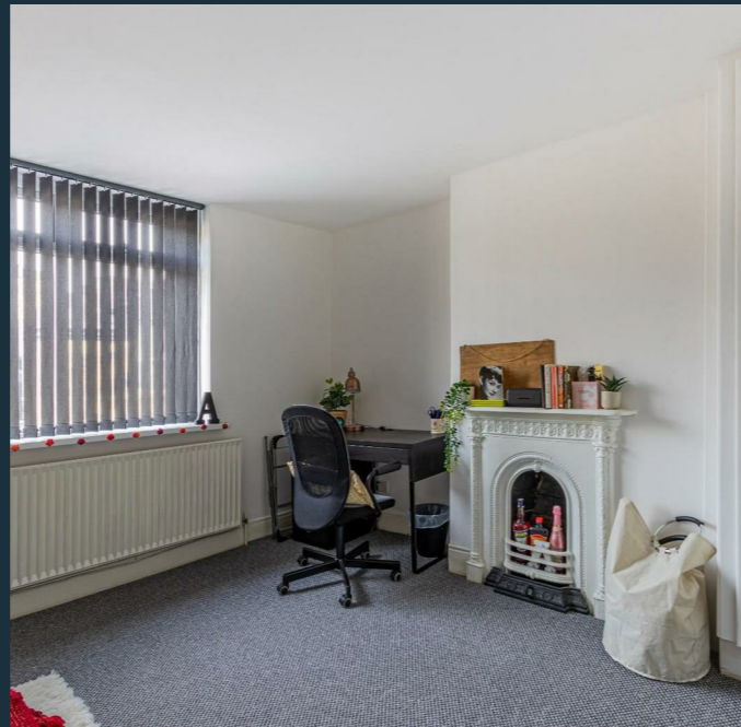
Mundy Place, Cathays