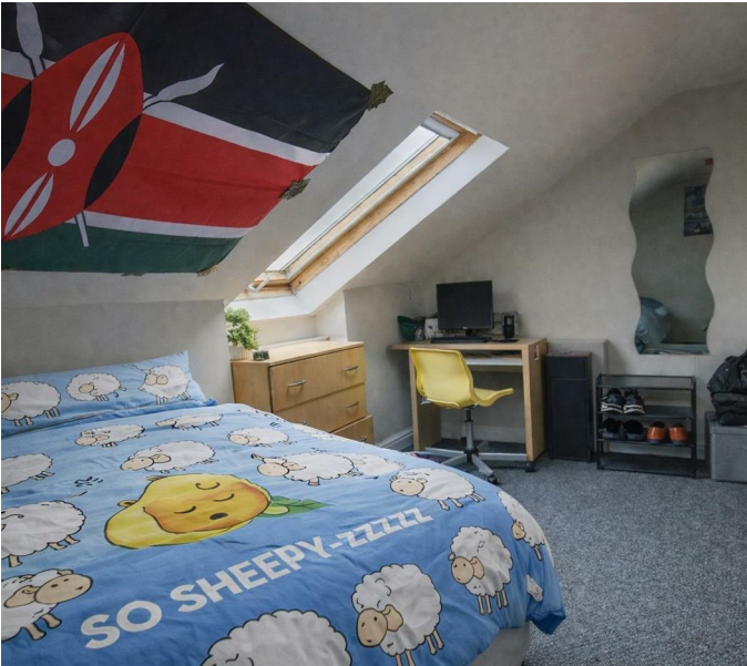
Merthyr Street, Cathays