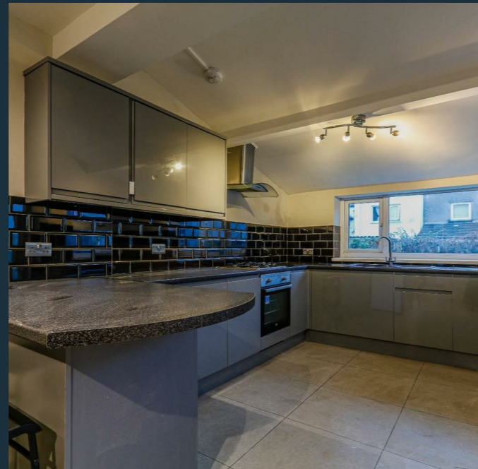
Dogfield Street, Cathays