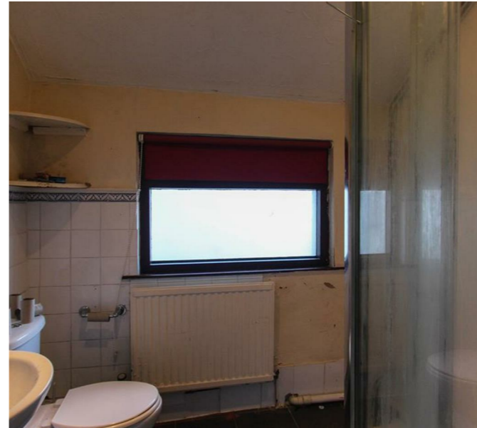
Coburn Street, Cathays