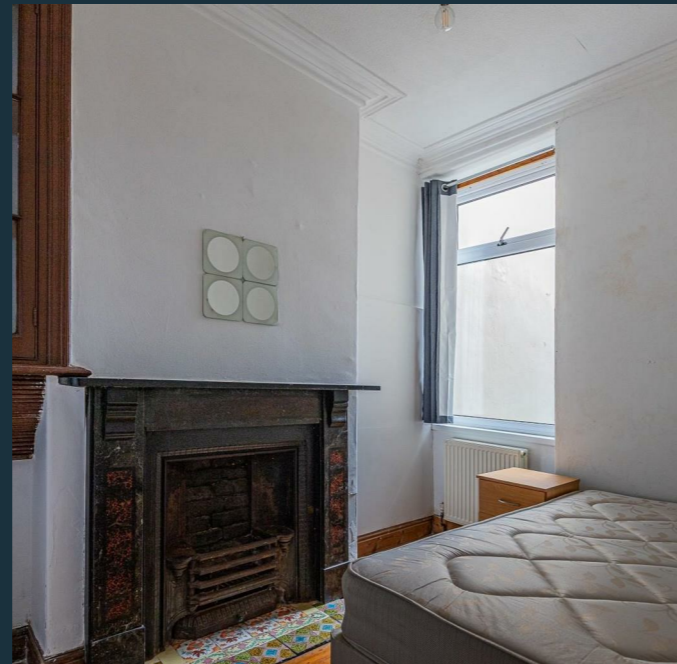
Tewkesbury Street, Cathays