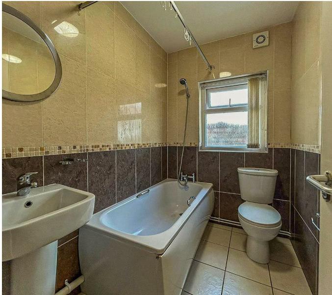
Richmond Road, Roath