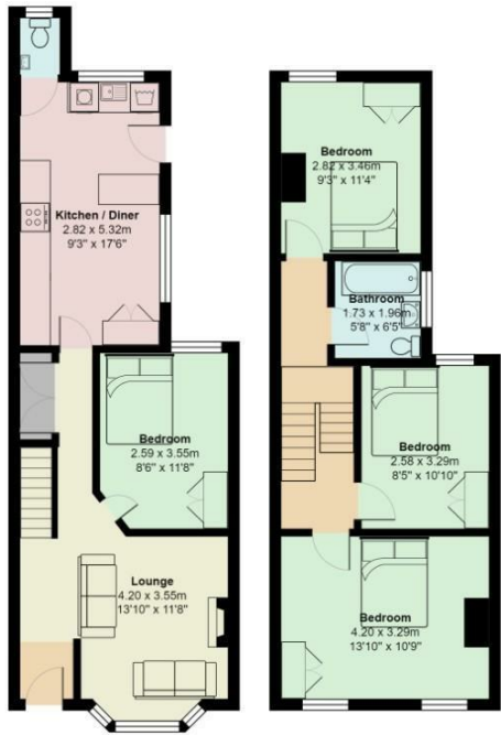
Arabella Street, Roath

Total Area: 91.2 m² ... 982 ft² All measurements are approximate and for display purposes only