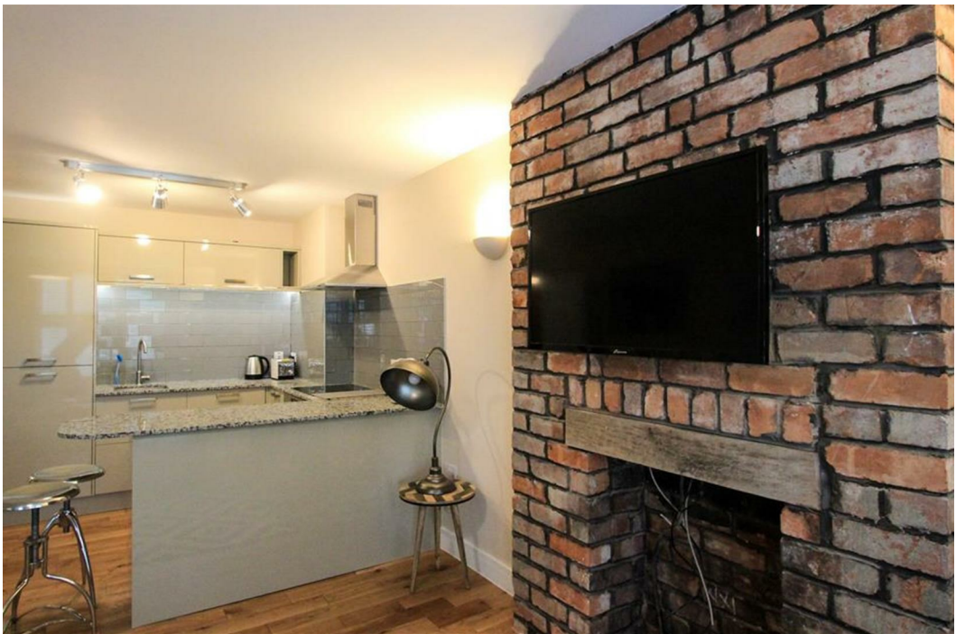
Howard Terrace, Roath